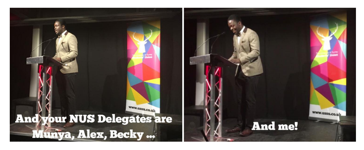
Well #NUSNC16 is their time to shine!

Remember in Surrey Decides when you were given the option to elect NUS Delegates?